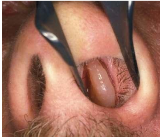
Figure 2. How a nasal polyp looks like.